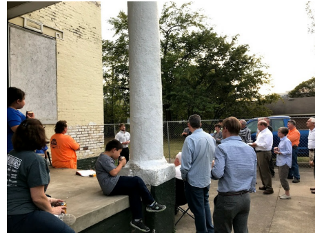
Attendees at the 2017 Preservation Conversations Masonry Workshop.